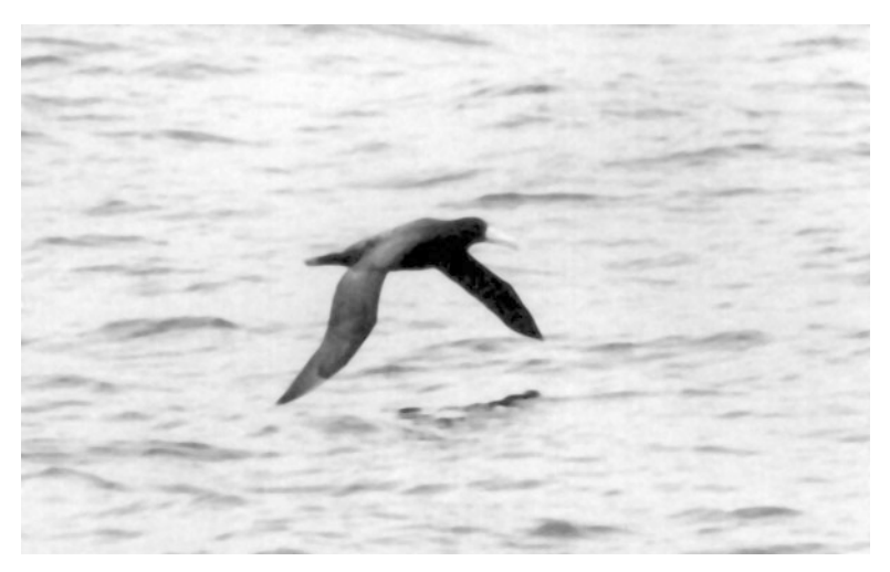
Figure 2. Short-tailed Albatross, Phoebastria albatrus , 26 nautical miles WSW of Point Buchon, San Luis Obispo County, 15 January 2002. The uniformly dark plumage suggests a juvenile; the apparent beginnings of a pale upperwing patch may be a result of wear.