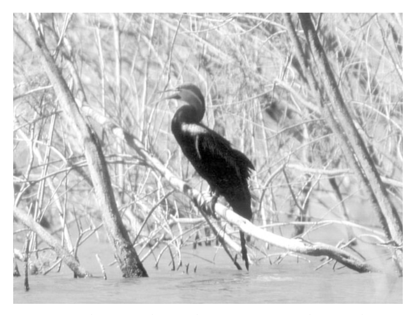
Figure 10. Female Darter, Anhinga melanogaster, at Ramer Lake, Imperial County, 13 July 2000. Presumed to be escaped from captivity, Darters have appeared at several locations in southern California and adjacent Baja California and may cause confusion with the Anhinga, Anhinga anhinga. Note the chestnut cap and nape, pale line leading back from the eye, and whitish throat merging into the rufous breast.