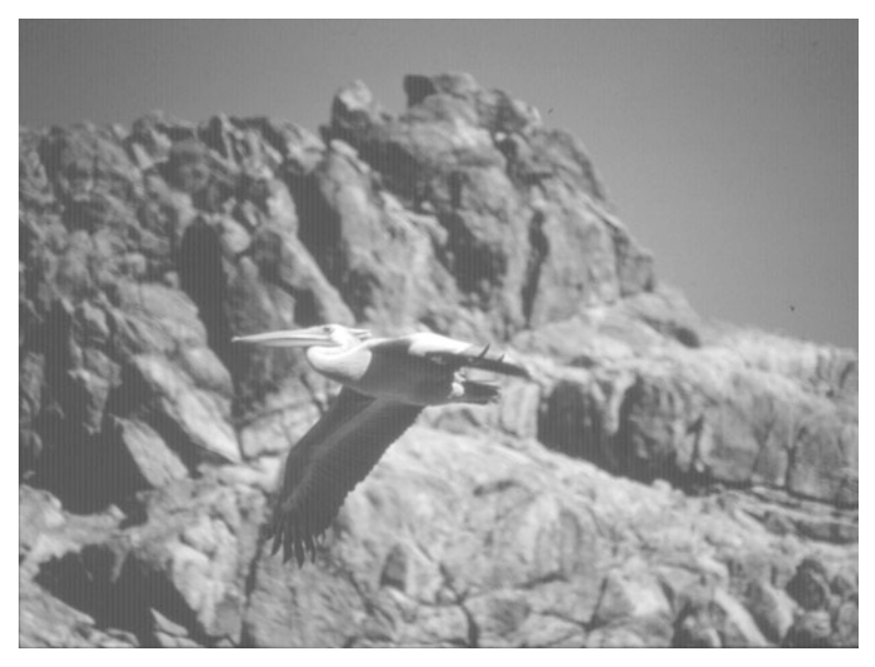
Figure 9. Pink-backed Pelican, Pelecanus rufescens , at Southeast Farallon I., San Francisco County, 23 October 2000. This bird's natural occurrence was considered questionable, but it is remarkable that even a presumed escaped bird made it to this remote locale.