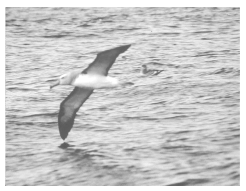
Figure 1. California's second Shy Albatross, Thalassarche cauta , at Cordell Bank, off Marin County, 10 September 2002. The distinctly gray head led most experts to conclude that the bird belonged to the subspecies salvini .