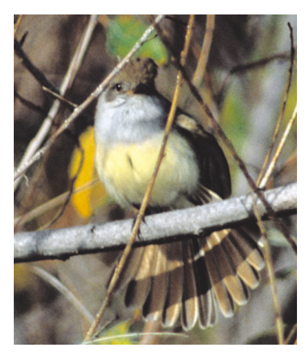
Figure 5. California's first Nutting's Flycatcher, Myiarchus nuttingi , in Irvine, Orange County, 23 December, 2000. Rufous in the rectrices was not so evident under most viewing conditions.