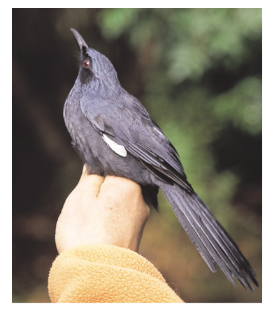
Figure 11. Adult Blue Mockingbird, Melanotis caerulescens , in Long Beach, Los Angeles County, 31 January 2000. The species was placed on the Supplement List because this individual was considered a possible escape from captivity. Note the aberrant tenth primary.