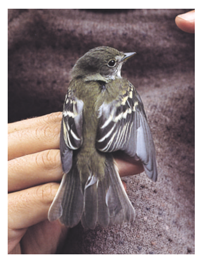
Figure 4. California's second Alder Flycatcher, Empidonax alnorum , on Southeast Farallon Island, San Francisco County, 27 August 1988. See text for a discussion of characters used to distinguish this individual from the the similar Willow Flycatcher ( E. traillii ).