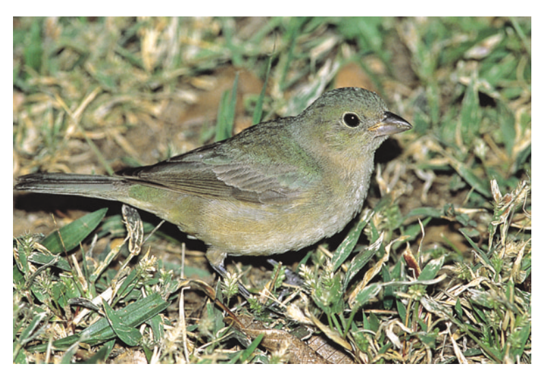
Figure 7. Immature Painted Bunting, Passerina ciris , in supplemental/transitory plumage at Galileo Hill Park, Kern County, 1 October 2000. Occurrences of this species in the West have increased, and a record nine individuals were accepted in California in 2000.