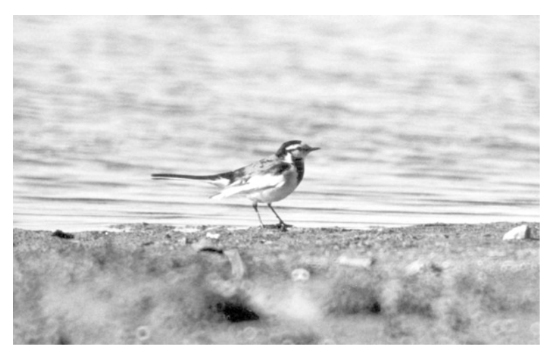
Figure 6. Adult male Black-backed Wagtail, Motacilla lugens , at Alviso, Santa Clara County, 17 December 2000.