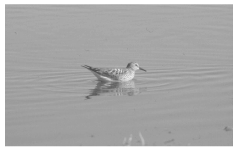
Figure 3. White-rumped Sandpiper, Calidris fuscicollis , at China Lake, Kern County, 26 May 2000.

BLACK-BILLED CUCKOO Coccyzus erythropthalmus (15, 0). An accepted record from Big Sycamore Canyon, VEN, 24 Sep 1974 (HLJ; 1980-235A; Binford 1985) was reconsidered. A majority vote is required to overturn an accepted record, but only two members voted against its continued acceptance.