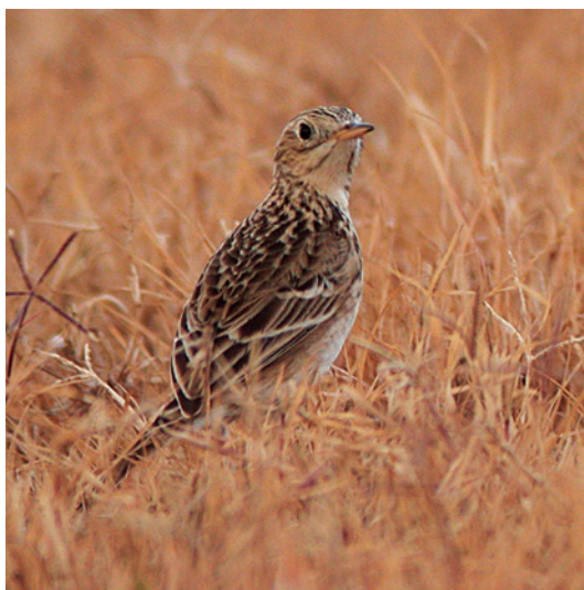
Figure 6. Sprague's Pipit, Anthus spragueii , 6 January 2003, one of a flock of up to 11 spending the winter of 2002–2003 near Calipatria, Imperial County.

WORM-EATING WARBLER Helmitheros vermivorus (94,2). One at the Santa Clara R. estuary, VEN, 21 Oct 1983 (GGi; 1994-068A) was first submitted to the Committee in 1994 and not accepted after four rounds (1994-068; McCaskie and San Miguel 1999). Subsequently the observer submitted additional documentation in the form of his original field sketch and notes and requested reevaluation, after which the record was accepted on the first round. Another Worm-eating Warbler was along Carpinteria Creek, SBA, 26 Sep–31 Oct 2002 (AC, JC; DMC, JEL, MSanM; 2002-179).