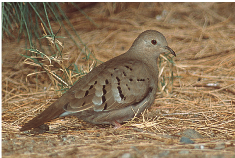
Figure 4. This Ruddy Ground-Dove, Columbina talpacoti , photographed 4 November 2001, spent the winter of 2001–2002 at Furnace Creek Ranch, Death Valley National Park, Inyo County. The Committee removed the Ruddy Ground-Dove from the review list following the unprecedented 28 birds, including this female, reported in 2002.

RUDDY GROUND-DOVE Columbina talpacoti (101,28). Up to five (3 males/2 females) were at Furnace Creek Ranch in Death Valley, INY, 13 Oct 2001–11 May 2002 (JLD; RB, ChH, AEK, JH, TH, JM, LS†, JWi; 2001-199; Figure 4). A female was at Mayflower Park in Blythe, RIV, 3 Nov–8 Dec 2001 (RH†; HBK, DWN; 2001-201), and up to four (2 males/2 females) were near there 4 Nov 2001–8 Mar 2002 (GMcC; NF, RH†, KZK†, BLaF, NLaF, MM, BoM†, JM, DWN†, MMR†, MSanM; 2001-189). Also in Blythe were two along Broadway 1 Dec 2001–27 Mar 2002 (RH†; 2002-124) and up to four along Riviera Drive 26 Oct 2002–30 Mar 2003 (HBK; 2002-178). A male was at L. Perris, RIV, 7–23 Dec 2002 (BED†, DFu†, MJSanM; 2002-208). Two were near the SE corner of El Centro, IMP, 27 Jan–15 Mar 2002 (KZK†; GCH, GMcC; 2002-033). Two were at Laguna Dam, IMP, 20 Dec 2002 (BH; 2003-016). All these were fall vagrants or winter visitors as has been the pattern of records for this species to date, but a female on the Primm Valley Golf Course near Nipton, SBE, 14 May 2002 (JCS; 2002-116) may have been