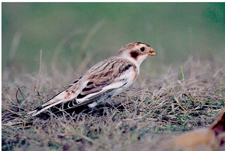
Figure 8. Snow Bunting, Plectrophenax nivalis , at MacKerricher State Park, Mendocino County, 13 November 2002.