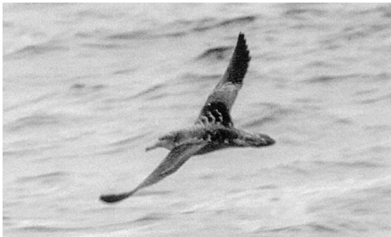
Figure 1. This Streaked Shearwater, Calonectris leucomelas , 5 miles of Westport, Mendocino Co., 17 August 2002 was one of an unprecedented four of this species reported in 2002.

RED-TAILED TROPICBIRD Phaethon rubricauda (20, 1). An adult photographed at 32° 20'N, 120° 20'W, 75 n. miles SW of San Nicolas I., VEN, 15 Oct 1993 (RRV†; 1994-030) was over waters where this species is probably of regular occurrence but birders rarely venture. Another Red-tailed Tropicbird reported with this one was not accepted by a majority of the Committee because of a lack of documentation.