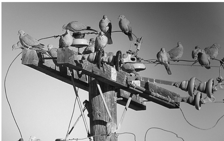
Figure 3. Flock of Eurasian Collared-Doves, Streptopelia decaocto , at Calipatria, Imperial County, 28 December 2002. The dove's rapid colonization of southeastern California led the Committee to add the species to the California state list.

Reports of Eurasian Collared-Doves in southeastern California near Lancaster, LA, 15 Mar–25 May 1998 (2001-089) and Brawley, IMP, 18 Jul–25 Aug 1999 (1999-140) and on the coast in Chula Vista, SD, 29 May 2002 (2002-112) were suspected to involve escapees. However, two in Ridgecrest, KER, 13 May 2001–present (LLa†; 2002-121), two near El Centro, IMP, 7 Aug 2001 (GMcC; 2002-034), one at Desert Center, RIV, 2 Nov 2001 (CMcG†; 2002-031), one near Bishop, INY, 8 Mar 2002 (DP, JPa; 2002-044), and nine at Blythe, RIV, 19 May 2002 (RH†; 2002-123) appear to have been the first to arrive by dispersal from the east. As of the end of 2003, populations appeared established at Blythe, RIV (Roger Higson pers. comm.), Desert Center, RIV (Chet McGaugh pers. comm.), and through much of the Imperial Valley, IMP (McCaskie pers. obs.). Individuals have been found as far west as San Clemente I., LA (Brian Sullivan pers. comm.).