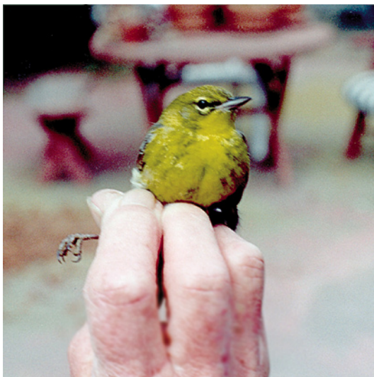
Figure 7. First-spring male Pine Warbler, Dendroica pinus , banded on Pt. Loma, San Diego County, 2 April 2002.

SCARLET TANAGER Piranga olivacea (119,4). A first-fall male was on San Clemente I., LA, 7 Nov 2001 (HCa; 2002-028). A male in Santa Cruz, SCZ, 7–11 Dec 2001 (KA; 2002-027) made California's third record for December. A male on San Nicolas Island, VEN, 8 Aug 2002 (SH; 2003-015) may have summered; it is only the second accepted in August and the earliest by more than two weeks. A first-fall male at Lemon Heights, ORA, 24–27 Nov 2002 (JEP; 2002-224) fit this species' usual late fall pattern; almost 70% of all accepted records of Scarlet Tanager are from this season.