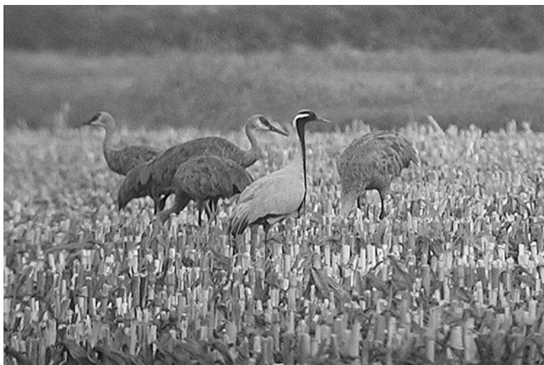
Figure 10. This striking Demoiselle Crane, Anthropoides virgo , spent the winter of 2001–2002 associating with Sandhill Cranes, Grus canadensis , in San Joaquin County. The Committee did not accept this record on grounds of questionable natural occurrence.