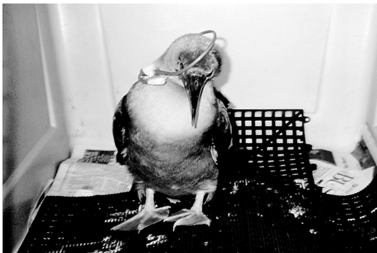
Figure 2. This Red-footed Booby, Sula sula , injured with a fish hook in its throat, was picked up at a pier in La Jolla, San Diego County, 20 July 2002. It escaped from a wildlife rehabilitator before the hook could be removed.