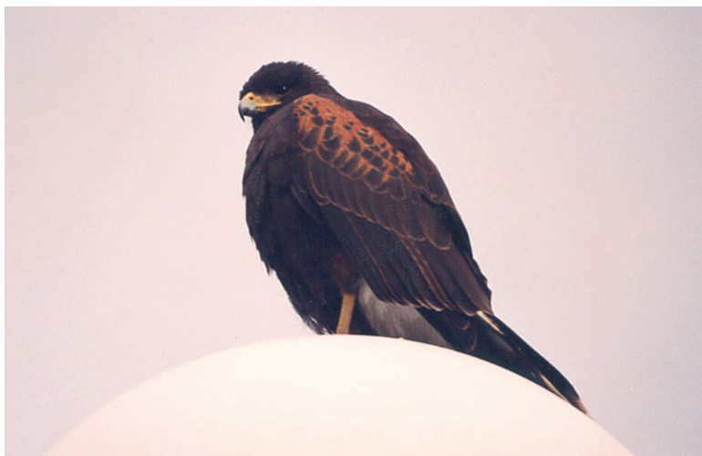
Figure 9. This Harris's Hawk, Parabuteo unicinctus , at Irvine, Orange County, 10–12 December 1994 was judged by the Committee to be outside the range of the incursion into the state that year and thus was not accepted on grounds of questionable natural occurrence.