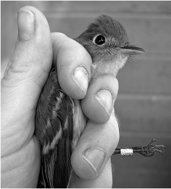
Figure 12. Most of the committee agreed that this bird, banded 18 October 2005 at Starr Ranch Audubon Sanctuary, Orange County, showed the classic field marks of a Yellow-bellied Flycatcher ( Empidonax flaviventris ). Measurements were inconsistent with that species, however, and no member was comfortable endorsing a record of an Empidonax with inconsistent measurements.