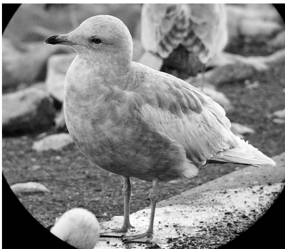
Figure 5. Reports of the Iceland Gull ( Larus glaucooides ) are among the most difficult records for the committee to assess because of potential confusion and introgression with Thayer's Gull ( L. thayeri ). This second-winter Iceland Gull at Milpitas, Santa Clara County, 22 February 2005 becomes the third accepted for California and the first in this plumage. This bird is especially dainty in structure, with the head rounded and the bill small in comparison to that of other gulls of similar size. It also shows a clean whitish iris and clean white primaries that simplify the identification in this case.