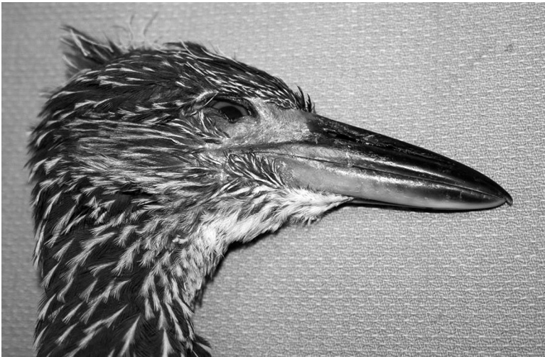
Figure 2. This very young Yellow-crowned Night-Heron ( Nyctanassa violacea ), with wisps of down still adhering to its crown feathers, was struck by a car at El Cajon, San Diego County, 23 August 2005, hinting at what might have been California's first breeding by this species. The yellow base to the mandible might suggest a Black-crowned Night-Heron ( Nycticorax nycticorax ) but is a character shared by very young Yellow-crowned as well. The identification as a Yellow-crowned is further confirmed by structure and measurements, as well as the complete white fringes to the greater coverts. The specimen is now number 51156 at the San Diego Natural History Museum.

YELLOW-CROWNED NIGHT-HERON Nyctanassa violacea (27, 5). A second-fall bird roosting in Inverness, MRN, 11 Oct–5 Dec 2005 (KB, CL, DEQ, RS, ANW†; 2005-135) established the northernmost record for California. A previously unreviewed photograph of an adult roosting in a eucalyptus at Sea World in San Diego, SD, 3 Apr 1979 (AM†; 2005-113) was published by Unitt (2004). Two two-year-old birds at the Tijuana R. estuary in Imperial Beach, SD, from 27 Jun 2005 (LW-L; MJB, TAB, MJ, GMcC, VM†, TPR†, MS†, RST; 2005-079) and 29 Jun 2005 onward (MJB; GMcC, VM†, MS†; 2005-080) had acquired adult plumage by the end of the year. They paired, built a nest, and fledged three young during the summer of 2006, the first nesting of the Yellow-crowned Night-Heron known for California. A photo appeared in N. Am. Birds 59:654. A recently fledged juvenile found struck by a car in El Cajon, SD, 23 Aug 2005 was taken to rehabilitator Meryl Faulkner of Project Wildlife. The bird died, and Philip Unitt prepared the specimen as a study skin (MFP-R†; SDNHM #51156; 2005-117). Photos of the recently dead bird (Figure 2) show an extensively yellow mandible, which concerned some members on the first round that a Black-crowned Night-Heron ( Nycticorax nycticorax ) or hybrid might