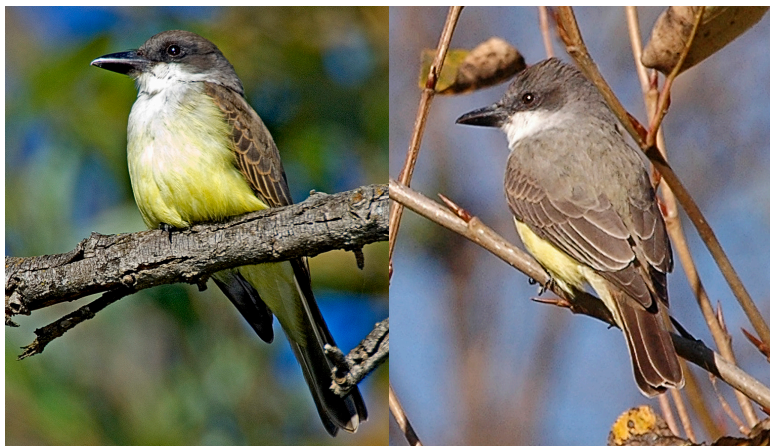
Figure 9. Accurate assessment of a bird's age is often essential to the review process, especially in the case of returning birds. In many species molt limits—the contrast between fresher new feathers generated by a recent molt and older, more worn feathers generated in a previous molt—are critical for this evaluation. On these Thick-billed Kingbirds ( Tyrannus crassirostris ), note a molt limit in the immature (A) where fresh gray-edged inner greater coverts contrast with older cinnamon-edged juvenal coverts. No molt limits are apparent in the adult (B), which also shows more squarish primary tips and rectrices. The first-winter bird (A) was photographed at L. Hodges, San Diego County, 29 November 2005, while the adult (B) was a returning bird photographed at Santa Paula, Ventura County, 4 December 2005.

RUBY-THROATED HUMMINGBIRD Archilochus colubris (8, 2). A female (age undetermined) at Furnace Cr. Ranch in Death Valley National Park, INY, 3 Sep 1988 (JLD†; MTH†, GMcC, MAP; 1988-163) establishes the fourth record for California. The original documentation was lost when it was sent out to experts for review, but some slides remained as a less-than-optimal basis for this record's overdue circulation. Descriptions suggest that the bird was not an immature male, since colored gorget feathers would have been noted if present. Although the photos do not show the diagnostic shape of the outermost (tenth) primary, the committee believed that this bird was identifiable through the combination of a short bill, bright green back, clean