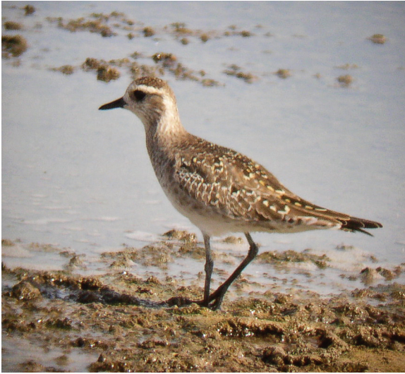
Figure 3. The committee undertook review of reports of the American Golden-Plover ( Pluvialis dominica ) in California starting in 2004. It has not had an easy time assessing records because of the close similarity of the Pacific Golden-Plover ( P. fulva ) in some plumages, especially in spring. While adult Pacifics attain their breeding plumage in March, Americans molt later and can closely resemble first-spring Pacifics that retain much of their basic plumage. Furthermore, tertial molt can complicate assessment of the extension of the primaries past the tertials. American Golden-Plovers in patchy April plumage are identifiable when they show fresh primaries since first-spring Pacifics have very worn, brownish primaries. This American Golden-Plover was at the south end of the Salton Sea, Imperial County, 8 April 2004.