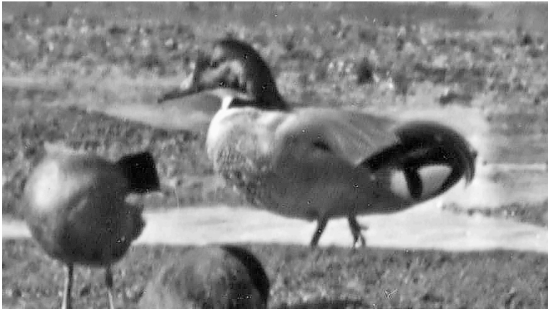
Figure 1. This adult male Falcated Duck ( Anas falcata ) at Upper Newport Bay, Orange County, January 1969 was accepted by the CBRC as a wild vagrant, after previously being considered an escapee from captivity, and so becomes the first of its species accepted for California.

FALCATED DUCK Anas falcata (2, 1). A male on Upper Newport Bay, ORA, 2 Jan–21 Feb 1969 (RBr†, GMcC; 1986-128A; Figure 1) becomes the first Falcated Duck accepted for California. One other record has been accepted by the committee, of a male at Honey L. W. A., LAS, 19 Mar–9 Apr 2002 and 2 Jan–11 Mar 2003 (San Miguel and McGrath 2005). The Orange County bird had previously been considered “identification established, origin uncertain” (Roberson 1993) and had previously been voted onto the supplemental list. On this second review, the Orange County