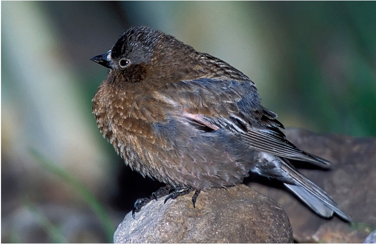
Figure 13. This rosy-finch at Aspendell, Inyo County, 29 April 2005 was reported as a Brown-capped ( Leucosticte australis ). Although the very limited gray on the crown suggests that species, the committee concluded it was a one-year-old female Gray-crowned Rosy-Finch ( L. tephrocotis ) with minimal gray on the head. The Brown-capped has crown feathers that are blackish centrally and gray on the edges and a bigger bill.