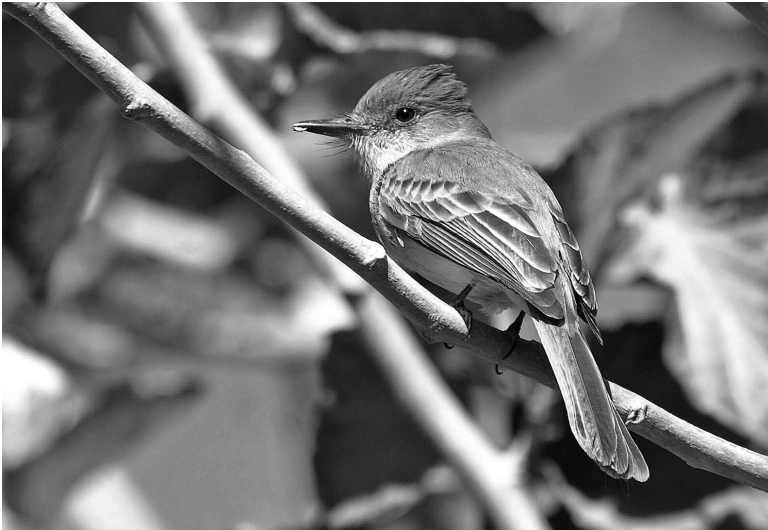
Figure 8. The Dusky-capped Flycatcher ( Myiarchus tuberculifer ) staged an invasion to California in winter 2005–06, with eleven accepted records (exceeding the previous high annual total of eight). This one was at Brawley 4 December 2005.