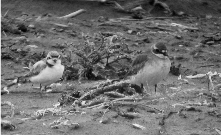
Figure 4. This adult Lesser Sand-Plover ( Charadrius mongolus ) at Clam Beach, Humboldt County, 11 July 2005, is a member of the mongolus subspecies group, consisting of C. m. mongolus and C. m. stegmanni , by virtue of the black line bisecting the white forehead patch. All North American records of adults have been of this subspecies group, with C. m. stegmanni , a regular migrant in western Alaska, being the most probable subspecies.