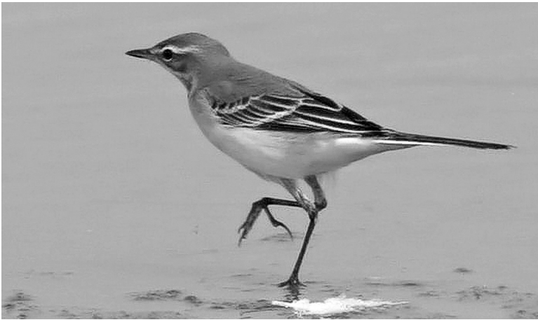
Figure 11. All Yellow Wagtails recorded in California have resembled this bird with its prominent supercilium, grayish body plumage, and whitish breast—features consistent with the expected Eastern Yellow Wagtail ( Motacilla tschutschensis ). Although some subspecies of the Western Yellow Wagtail ( Motacilla flava ) are indistinguishable in the corresponding plumage from birds such as this one, since the 2004 split the CBRC has been content to consider California records to pertain to the geographically probable Eastern Yellow Wagtail. Photographed 17 September 2005 at MacKerricher State Park, Mendocino County.

Heindel investigated these wagtails' identification. While adults in breeding plumage should be identifiable to species and subspecies (see Alström and Mild 2003), winter adults and immatures are far more difficult to identify. The 14 California records to date are in the fall (27 Aug–21 Sep) and all apparently pertain to first-fall birds, which cannot be reliably identified to species, in many cases even with a specimen. California records have primarily been of grayish birds with white breasts, a pattern that Alström and Mild (2003) noted can occur in all subspecies but is common only in beerna and feldegg within the Western Yellow Wagtail and tschutschensis (including simillima ) and taivana within the Eastern Yellow Wagtail. The prominent supercilium shown by