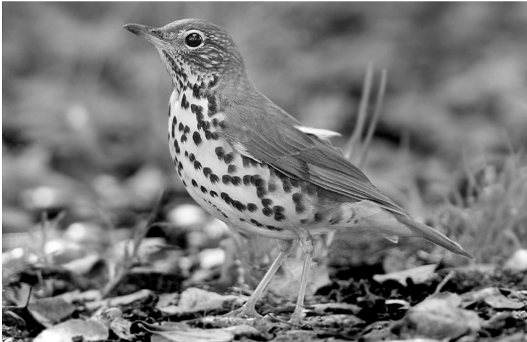
Figure 10. Three Wood Thrushes ( Hylocichla mustelina ) in California in 2005 were more than average. This individual, in its first winter as attested by the whitish spots on the tips of the greater coverts, was at Santa Maria, Santa Barbara County, 12 Nov 2005.

EASTERN YELLOW WAGTAIL Motacilla tschutschensis (14, 2). One in its first fall at Abbott's Lagoon, MRN, 7–8 Sep 2004 (Sj; NF, KH†, SNGH†, KK; 2004-139) was the third recorded at this location. Another in its first fall was along the beach at MacKerricher State Park, Fort Bragg, MEN, 16–17 Sep 2005 (GC, RJK, RL†, CL, LML‡, RST, JRW; 2005-118; Figure 11), with a photo also published in N. Am. Birds 60:135.