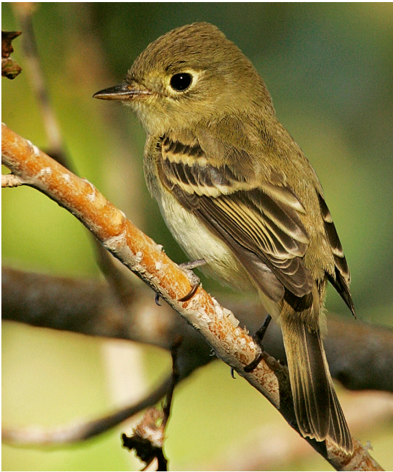
Figure 7. The spacing of the primaries has been proposed as a field mark useful for distinguishing the Yellow-bellied Flycatcher ( Empidonax flaviventris ) from the similar Western Flycatcher ( E. difficilis/occidentalis ). This Yellow-bellied at Galileo Hill, Kern County, 3 October 2004, shows atypical primary spacing yet has the crisp yellowish wing edging, even-width eye ring, lack of a crested appearance, and relatively short tail that allows for identification of silent individuals.