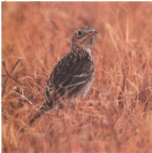
Figure 6. Sprague's Pipit, Anthus spragueii , 6 January 2003, one of a flock of up to 11 spending the winter of 2002–2003 near Calipatria, Imperial County.

GRACE'S WARBLER Dendroica graciae (37,0). A female wintering at Point Loma, SD, 11 Sep 2002–2 Feb 2003 (GMcC, TMcG; 2002-158) was thought to be the same bird that spent the previous winter there (2001-153; Garrett and Wilson 2002).