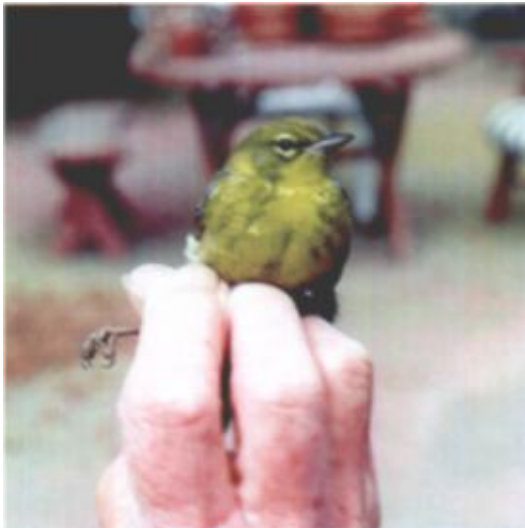
Figure 7. First-spring male Pine Warbler, Dendroica pinus , banded on Pt. Loma, San Diego County, 2 April 2002.

MOURNING WARBLER Oporornis philadelphia (121,7). A male was at Army Springs on San Nicolas I., VEN, 17–18 Jun 2000 (RAH; 2002-141). One at the Arcata Marsh Project, HUM, 5 Oct 2001 (DFx; 2001-168) was seen briefly and required three rounds for passage. A female was at Furnace Creek Ranch, INY, 26 May 2002 (SBT; 2002-108). One was at Mojave, KER, 11 Sep 2002 (MJSanM; TMcG, MSanM, JCW; 2002-157). An adult male was at Fort Rosecrans National Cemetery on Point Loma, SD, 21–25 Sep 2002 (JWo; DFu, PAG, GMcC, TMcG,