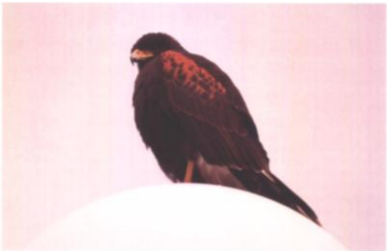
Figure 9. This Harris's Hawk, Parabuteo unicinctus , at Irvine, Orange County, 10–12 December 1994 was judged by the Committee to be outside the range of the incursion into the state that year and thus was not accepted on grounds of questionable natural occurrence.