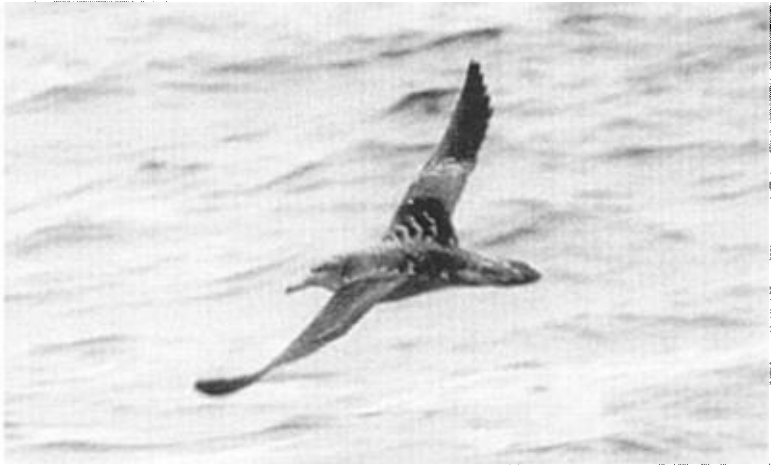
Figure 1. This Streaked Shearwater, Calonectris leucomelas , 5 miles of Westport, Mendocino Co., 17 August 2002 was one of an unprecedented four of this species reported in 2002.

MANX SHEARWATER Puffinus puffinus (75, 9). One 4.5 n. miles NW of the Palos Verdes Peninsula 23 Feb 2002 (TMcG†; DMH, MS†; 2002-041) and one seen from West Cove Point on San Clemente I., 4 Mar 2002 (BLS; 2002-063) were the second and third to be recorded in Los Angeles Co. One off Pigeon Point, SM, 12 May 2002 (AME; 2002-099) was the sixth to be seen from shore at this location. One off Fort Bragg 2 Jun 2002 (PP; RJK, TMcK, DT; 2002-106) and another seen from shore at Fort Bragg 16 Aug 2002 (JLD; GMcC, MSanM; 2002-149) were the first and second for Mendocino Co. One seen from shore at the Santa Maria R. mouth 8 Sep 2002 (BKS; 2002-210) was the first for Santa Barbara Co. Single birds 3 miles W of Point Pinos, MTY, 17 Feb 2002 (TMcG; 2002-151), at 36.396°N, 122.009°W on Monterey Bay, MTY, 9 Aug 2002 (DLSh; 2002-145), and 36° 49.67'N, 122°