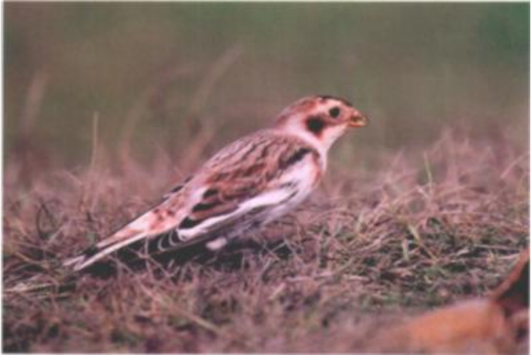
Figure 8. Snow Bunting, Plectrophenax nivalis , at MacKerricher State Park, Mendocino County, 13 November 2002.