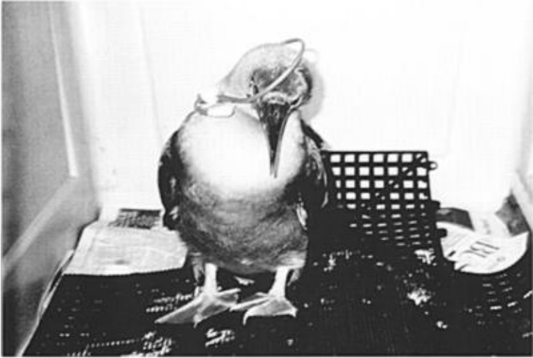
Figure 2. This Red-footed Booby, Sula sula , injured with a fish hook in its throat, was picked up at a pier in La Jolla, San Diego County, 20 July 2002. It escaped from a wildlife rehabilitator before the hook could be removed.