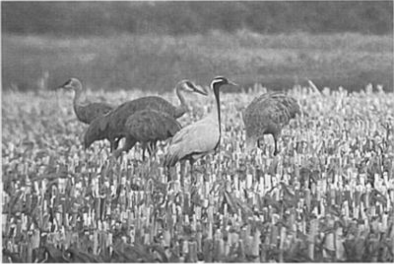
Figure 10. This striking Demoiselle Crane, Anthropoides virgo , spent the winter of 2001–2002 associating with Sandhill Cranes, Grus canadensis , in San Joaquin County. The Committee did not accept this record on grounds of questionable natural occurrence.