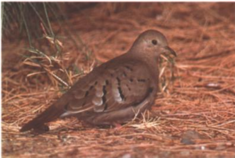
Figure 4. This Ruddy Ground-Dove, Columbina talpacoti , photographed 4 November 2001, spent the winter of 2001–2002 at Furnace Creek Ranch, Death Valley National Park, Inyo County. The Committee removed the Ruddy Ground-Dove from the review list following the unprecedented 28 birds, including this female, reported in 2002.

RUDDY GROUND-DOVE Columbina talpacoti (101,28). Up to five (3 males/2 females) were at Furnace Creek Ranch in Death Valley, INY, 13 Oct 2001–11 May 2002 (JLD; RB, ChH, AEK, JH, TH, JM, LS†, JW; 2001-199; Figure 4). A female was at Mayflower Park in Blythe, RIV, 3 Nov–8 Dec 2001 (RH‡; HBK, DWN; 2001-201), and up to four (2 males/2 females) were near there 4 Nov 2001–8 Mar 2002 (GMcC; NF, RH‡, KZK†, BLaF, NLaF, MM, BoM†, JM, DWN†, MMR†, MSanM;