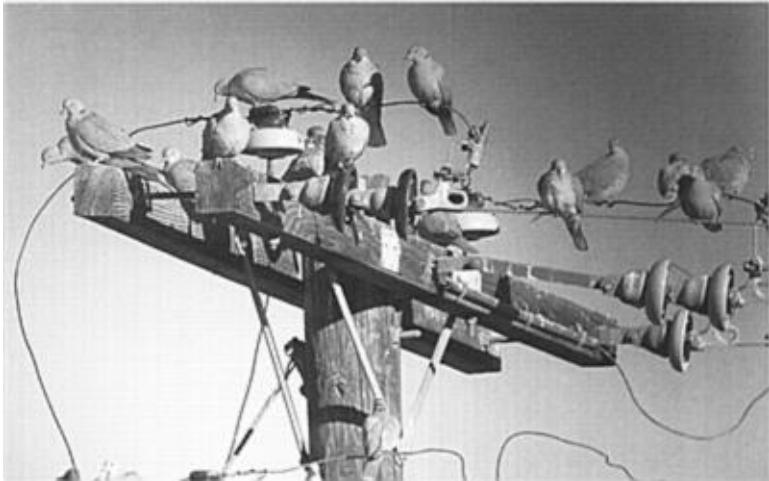
Figure 3. Flock of Eurasian Collared-Doves, Streptopelia decaocto , at Calipatria, Imperial County, 28 December 2002. The dove's rapid colonization of southeastern California led the Committee to add the species to the California state list.

Reports of Eurasian Collared-Doves in southeastern California near Lancaster, LA, 15 Mar–25 May 1998 (2001-089) and Brawley, IMP, 18 Jul–25 Aug 1999 (1999-140) and on the coast in Chula Vista, SD, 29 May 2002 (2002-112) were suspected to involve escapees. However, two in Ridgecrest, KER, 13 May 2001–present (LLaT;