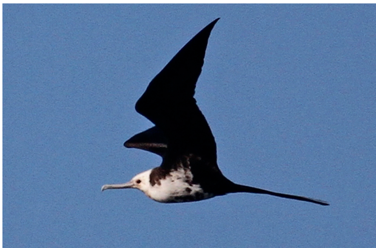
Figure 6. A second-cycle or third-cycle Great Frigatebird at Pt. Pinos, Monterey County, 2 Nov 2016 (2016-140) represented the third record for California (and the second from Monterey County) and one of only four for North America.