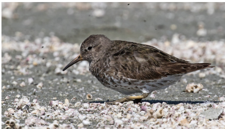
Figure 2. On 27 Mar 2016, when this photo was taken, this Purple Sandpiper ( Calidris maritima ) at Salt Creek Beach on the east shore of the Salton Sea, Riverside County (2016-028), was in mostly basic plumage, with dirty yellow rather than brighter orangish legs, so virtually identical to a Rock Sandpiper ( C. ptilocnemis ).