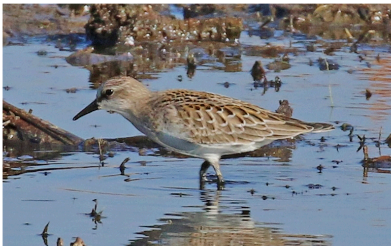
Figure 1. This juvenile Red-necked Stint ( Calidris ruficollis ) at the San Jacinto Wildlife Area, Riverside County, 6 Sep 2016 (2016-072) shows the long primary projection that distinguishes it from a Western Sandpiper ( C. mauri ). The wing coverts and tertials have buffy to pale gray edges and darkish centers rather than the rufous edges and black centers of the juvenile Little Stint ( C. minuta ).