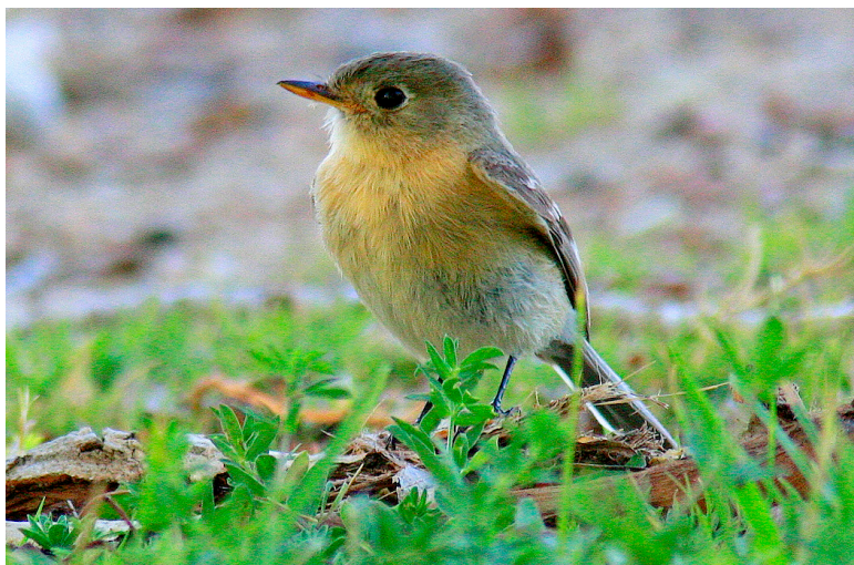
Figure 7. California's first Buff-breasted Flycatcher was at Galileo Hill, Kern County, 15 May 2016 (2016-034).