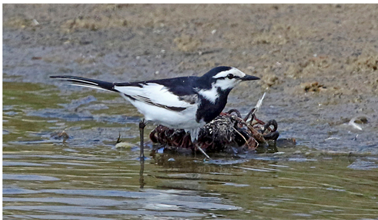
Figure 8. This male White Wagtail of the black-backed subspecies lugens was at the Pismo Creek mouth, San Luis Obispo County, 22 Apr 2016 (2016-026).