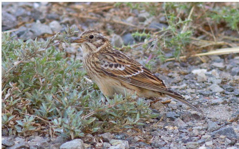
Figure 9. The first Smith's Longspur in southern California away from the interior desert region was on San Clemente I., Los Angeles County, 23 Sep 2016 (2016-085).