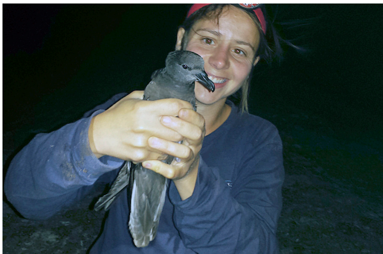
Figure 5. The first Jouanin's Petrel accepted for California was captured on Santa Barbara Island, Santa Barbara County, 1 Jun 2016 (2016-058) during nighttime mist netting for Ashy Storm-Petrels ( Oceanodroma homochroa ). There are no previous records of this Indian Ocean species for North America or for anywhere in the Pacific Ocean, apart from four records from the Hawaiian Islands.