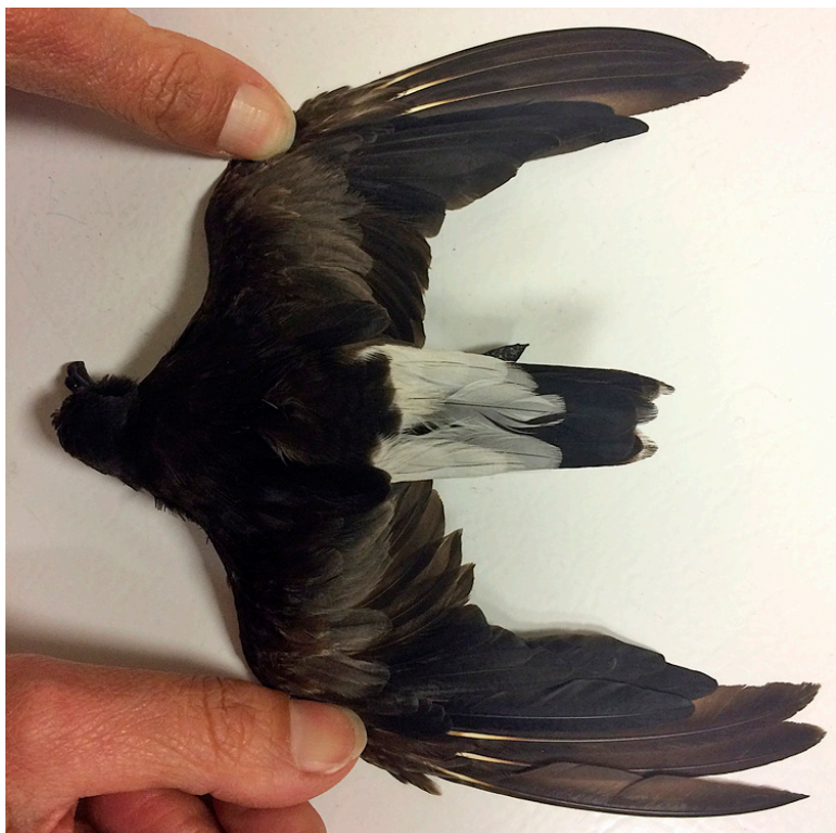
Figure 4. Molting Wedge-rumped Storm-Petrel found dead on the south spit of Humboldt Bay, Humboldt County, 1 May 2016 (2016-031). This photo shows the species' very long white uppertail coverts (with black shafts) that extend a substantial distance along the tail.